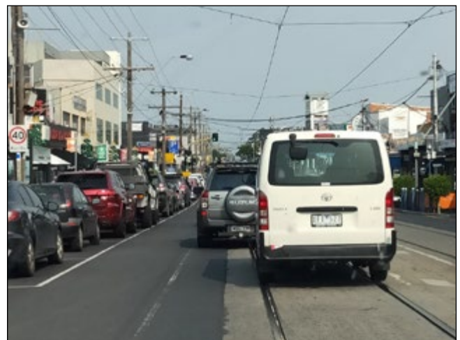
Figure 3: Example of high visual clutter and complexity in the road environment

clothing, or a lower speed zone sign. In these driving environments where drivers are expected to pick out specific or important information, driver behaviour will often not be perfect and consequently may not be safe. It will certainly also have adverse consequences for vulnerable road users. Again, this failure should not be attributed to driver error, rather it is a consequence of inadequate design of the road system. A primary solution to this problem is to avoid road environments like this through separation of road uses such as only allowing off-street parking, separating all types of vehicles by separating car, tram and bicycle lanes and separating pedestrian traffic.