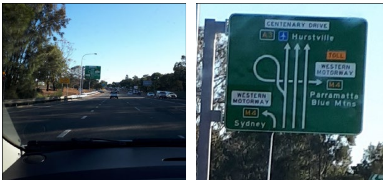
Figure 1: Example of poor and confusing signage