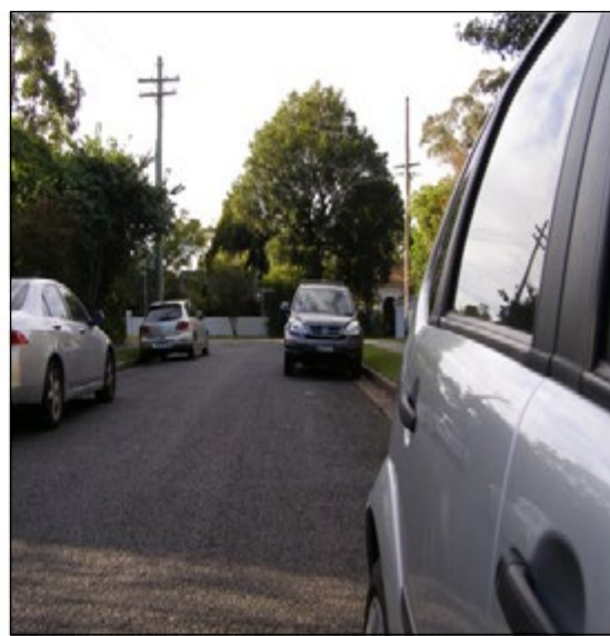
Figure 5: Example of the false visual information from convex side mirrors